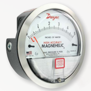
High Accuracy Magnehelic® gage Shown with optional -SS bezel