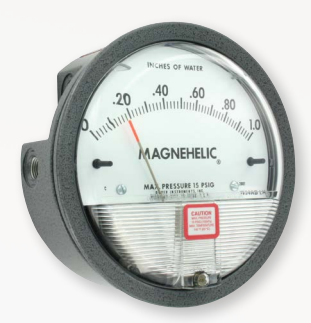
Standard Magnehelic® gage